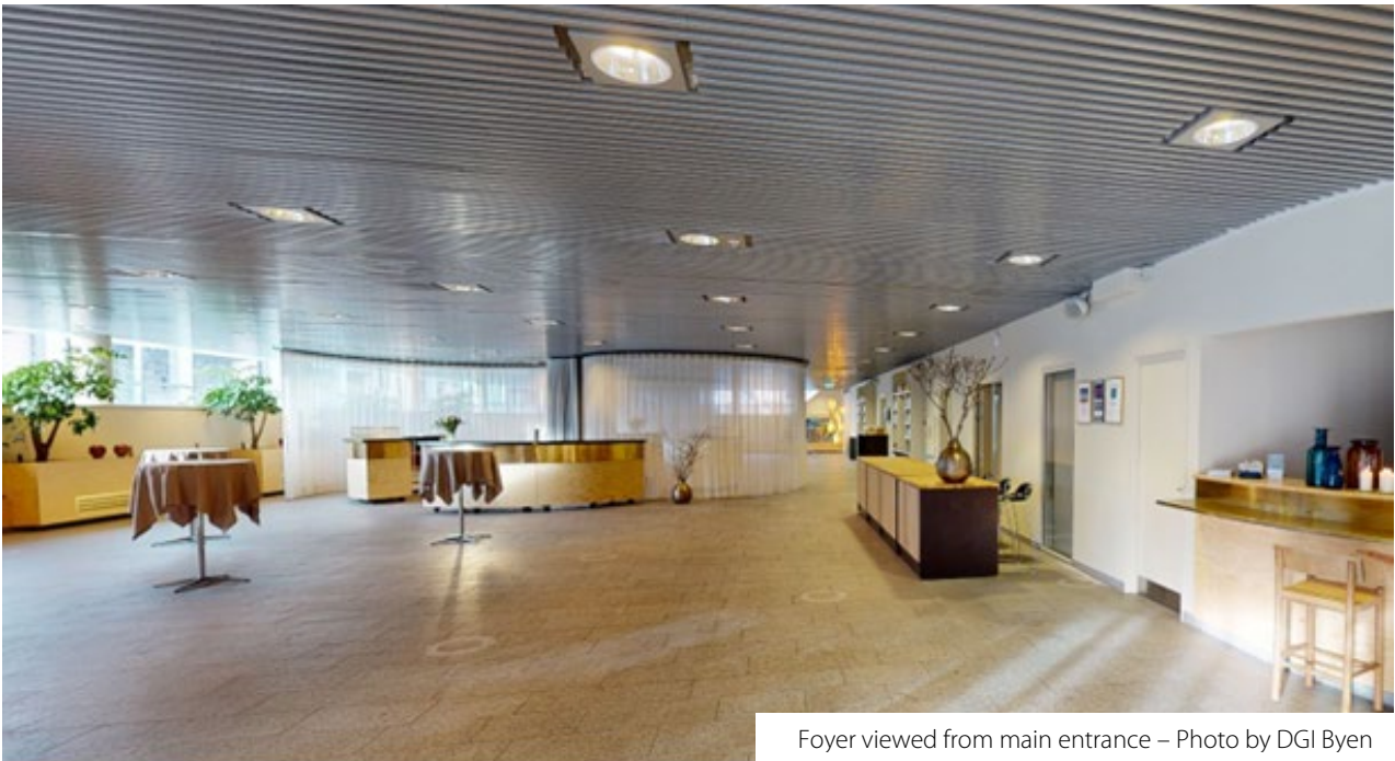
Foyer viewed from main entrance

Each booth will be equipped with a large table and two chairs (Platinum and Gold) or a bar table with one chair (Silver).