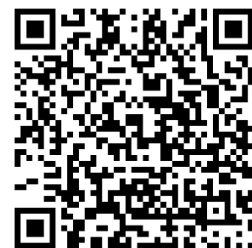
Get a 360° tour of CPH Conference / DGI Byen